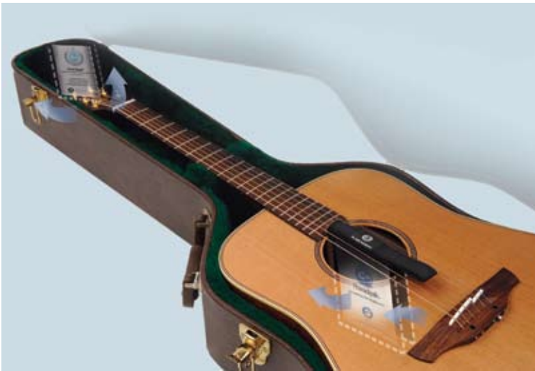
FIGURE 1.4 Here is the Planet Waves Humidipack Humidifier.

There are two types of humidifiers that I recommend depending upon where and how your guitar is kept. If your guitar is outside of the case in a rehearsal hall, studio or bedroom, I recommend a warm-mist room humidifier. Used with your Humidity Control Sensor (humidity gauge), this method will be quite sufficient. For those times when you are on the road, or transporting your guitar, I recommend a brand new product that I have been working with called the Humidipack™ Automatic Humidity Control System by Planet Waves . This humidification system can be found in most music stores. It is so easy to use. It keeps the humidity at exactly 45%. If the humidity drops, it adds moisture. If it is too high, the Humidipack removes moisture. It takes all of the guesswork out of controlling humidity. You only have to replace the Humidipack refill packets about every 4 months (duration varies on seasonal and climate conditions). You just slide the soundhole pouch in between your strings and place the other pouch into the headstock cavity of your guitar case and go. It's that easy! No drips, no worries. I still recommend that you use a humidity sensor with it, but I can't stress how much money and aggravation this product will save you! Or, if you want to keep spending lots of money on guys like me, then please don't control the humidity of your guitar. I could use a new Porsche!