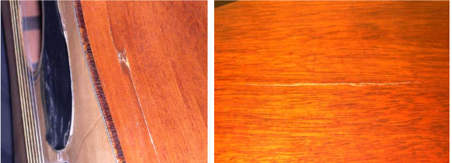
FIGURE 1.2 This guitar has been repaired, but the scars still remain.

Take your guitar to a qualified Luthier. Most of these repairs can be costly! I know this firsthand because most of my income in the winter comes from these types of repairs. They are time-consuming, which in my industry equals expensive. Keep in mind that if you don't take care of these problems now, they can cost you even more later. The best remedy is prevention. These problems can be repaired, but it's likely that you will always see the scars, so take care to prevent them from occurring in the first place.