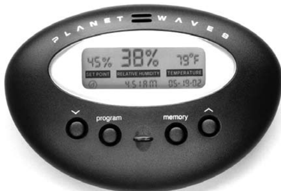
FIGURE 1.3 The Planet Waves Humidity Control Sensor shows both the temperature and humidity.

There are several products on the market to help you identify the humidity level in your environment. I recommend a digital one that measures both temperature and humidity. The Planet Waves Humidity Control Sensor is the best I've used. It has been a part of my shop ever since it hit the market. It is fully programmable. It not only measures the temperature and humidity, it also tells you when it has reached its highs and lows. This way, you know when to use your humidifier. It has a time & date feature, and an indicator that the humidity is too low. Consider it to be an inexpensive insurance policy for your guitar.